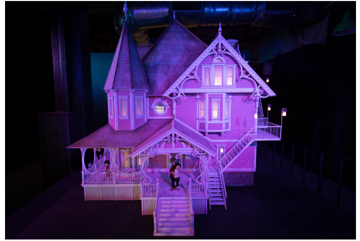
Coraline's Other World House Exterior Coraline (2009)

For ParaNorman , the model shop made 26 animatable (meaning, with moving parts) vehicles — all can roll forward and backward, and most of them have working headlamps, windows, and taillights. In addition, 8 complete versions of the van were made for the shoot: 2 for exterior shots, 2 for interior shots, 2 for the rollover sequence, and 2 built at half the size for long-distance road shots.