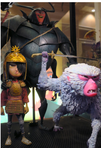
Main Character (left) – Kubo, Monkey (right), Beetle (back) Kubo and the Two Strings (2016)

Coraline's Other World house, also known as the Pink Palace, is one of the many iconic locations in LAIKA's first feature film, Coraline . This roughly 1/6 scale miniature is a perfect display of LAIKA's unmatched artistry and attention to detail. Designed by concept artist Michel Breton, it's one of two matching duplicate Other World houses built to satisfy the film's production schedule.