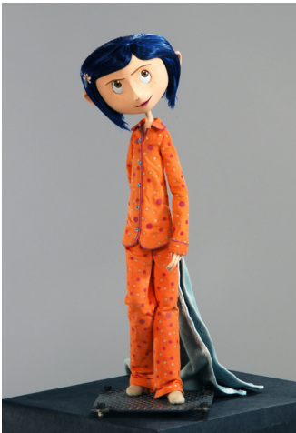
Main Character – Coraline Coraline (2009)

For its first feature film, Coraline , LAIKA created twenty-eight identical Coraline puppets. There were forty-two wigs constructed with hair made from synthetic mohair laid onto wires so it could be adjusted and moved by the animators. Her iconic hair color was a unique blend of three colors mixed with textured paste.