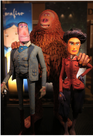
Mr. Link (back), Adelina Fortnight (right), Sir Lionel Frost (left) Missing Link (2019)

In Missing Link , not only did LAIKA build the largest hero puppet for this film, they also built and animated the smallest. All the puppets for Missing Link were built approximately 20% smaller than the puppets of previous LAIKA films. This scale difference allowed sets to be smaller and kept Mr. Link, the largest character in the film, at an animator-friendly size of 16" tall.