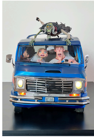
Mitch's Van with Zombie Judge ParaNorman (2012)

In Missing Link , not only did LAIKA build the largest hero puppet for this film, they also built and animated the smallest. All the puppets for Missing Link were built approximately 20% smaller than the puppets of previous LAIKA films. This scale difference allowed sets to be smaller and kept Mr. Link, the largest character in the film, at an animator-friendly size of 16" tall.