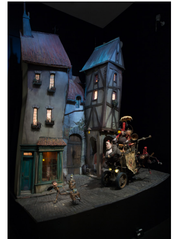
Tavern Street Buildings 4, 5, 6 The Boxtrolls (2014)

For ParaNorman , twenty-eight identical Norman puppets were constructed. Norman's distinctive hairstyle has 275 spikes and was made from goat hair that was held together with hot glue, hair gel, fabric, super glue, and medical adhesive. It was hand-finished with paint and human hair dye.